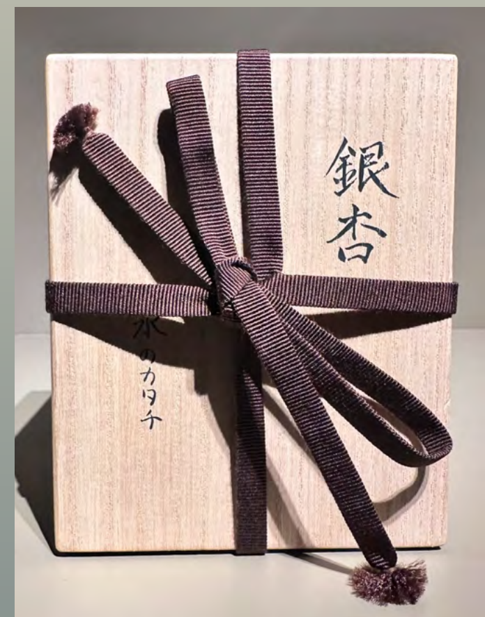
Works are presented in a custom-made wooden box ( tomobako ) signed by the artist

“All my works are inspired by motifs I encounter during my walks. Wild grasses and flowers, which are abundant but often overlooked, reveal incredible beauty when observed closely and thoughtfully. These plants constantly change their appearance, shaped by external elements such as wind, rain, and sunlight, transforming into new, captivating compositions with every passing moment. I aim to capture these fleeting moments of natural beauty and bring them to life through my creations. Additionally, a defining feature of my work is that every piece is crafted entirely from metal, with the colours reflecting the natural hues of the materials themselves. Through these works that combine the elements of metal and plants, I hope you can fully experience the mystery and beauty of the cycle of life.”